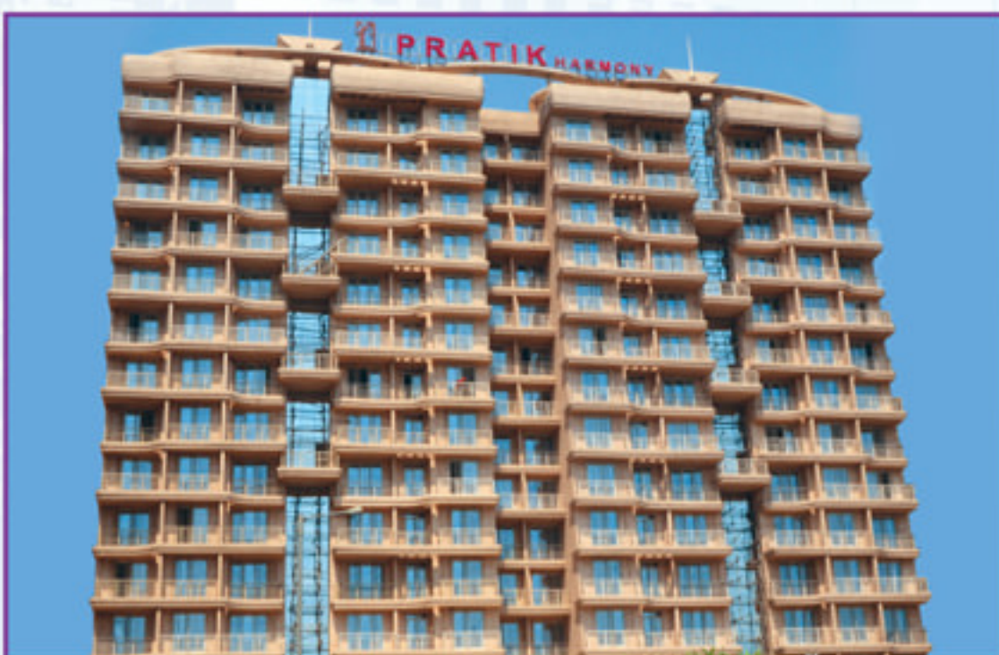
PRATIK HARMONY - ROADPALI