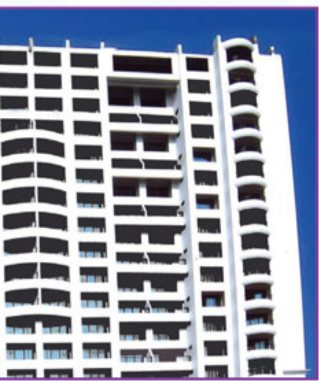
ALM BEACH ROAD