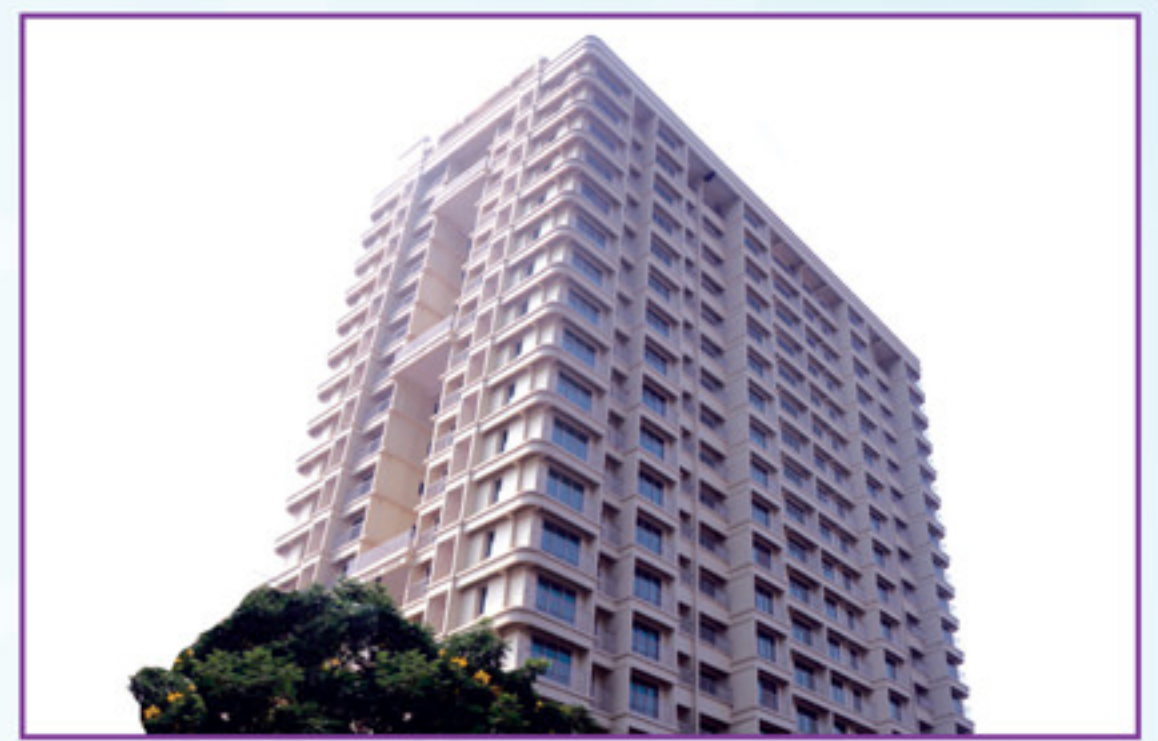
LOTUS VARDHMAN - THANE