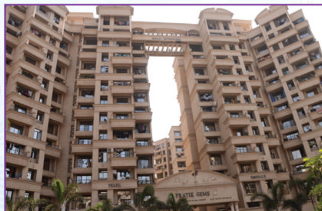
PRATIK GEMS - KAMOTHE