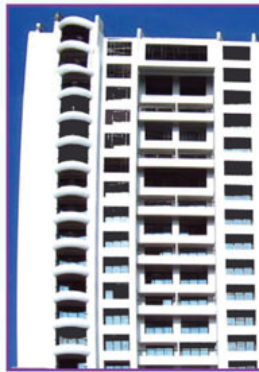
MORAJ - PA