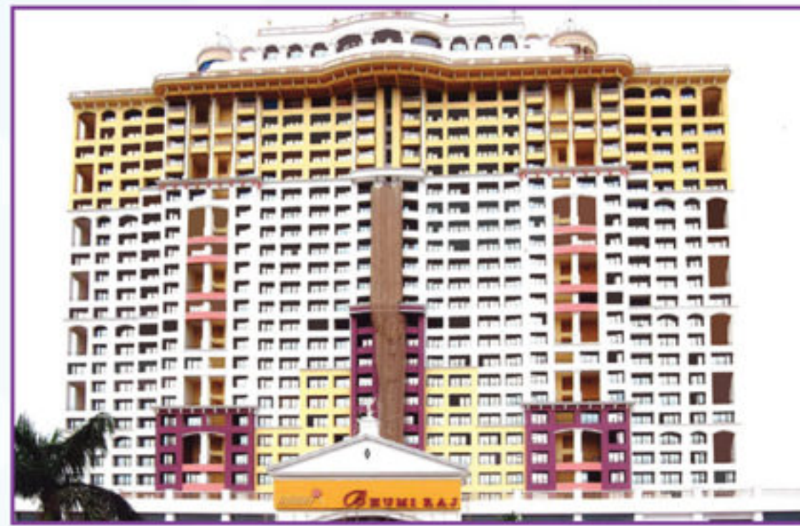
BHUMIRAJ - PALM BEACH ROAD