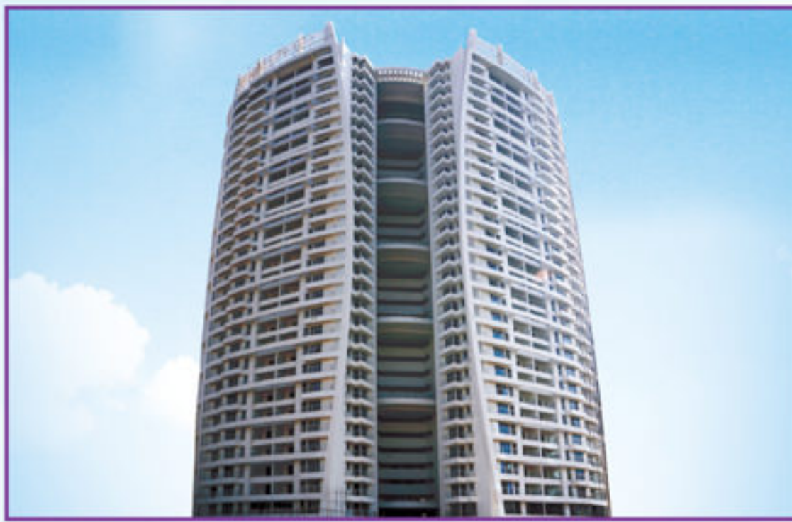
ROSABELLA - THANE