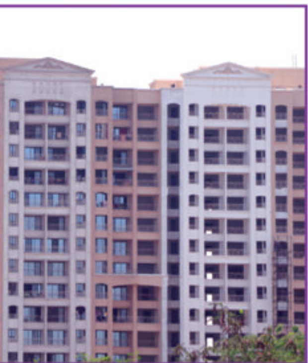
XMI - KALYAN