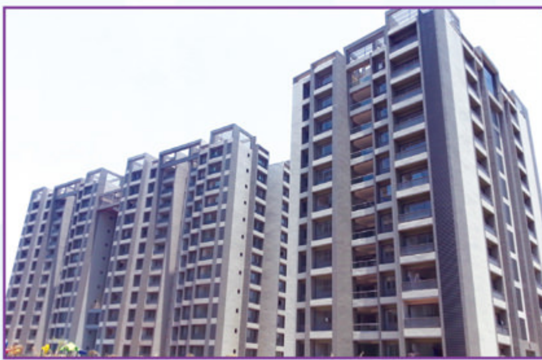
ISCON - AHMEDABAD