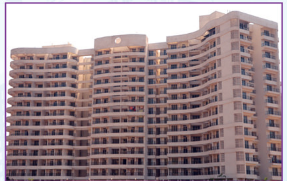
BHOOMI GARDENIA - ROADPALI