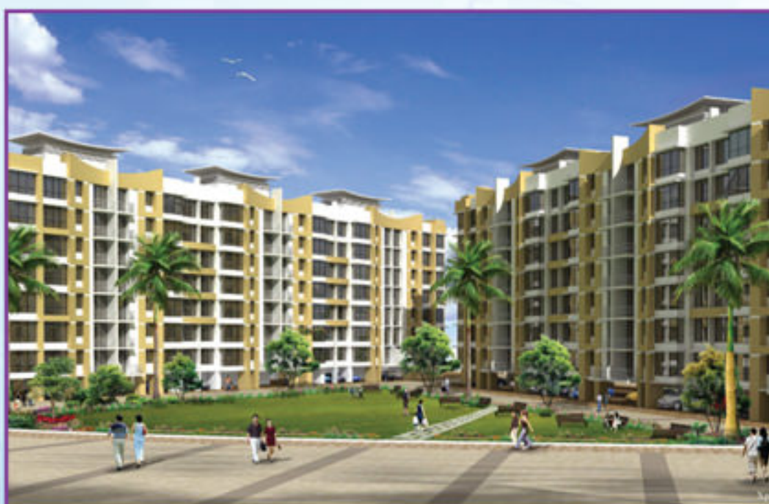
RAJHANS KSHITIJ - VASAI