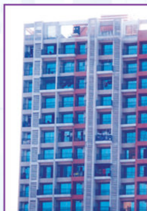
MARVEL - K