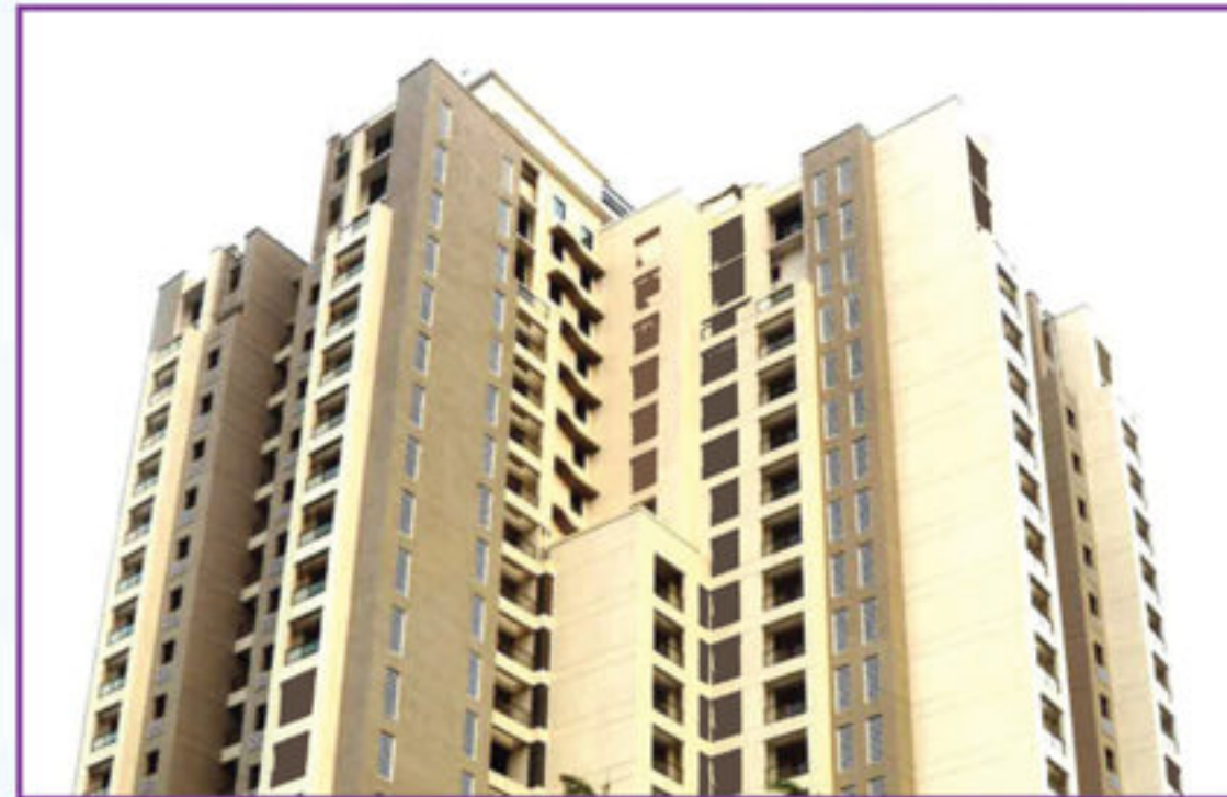
AHCL - BORIVALI