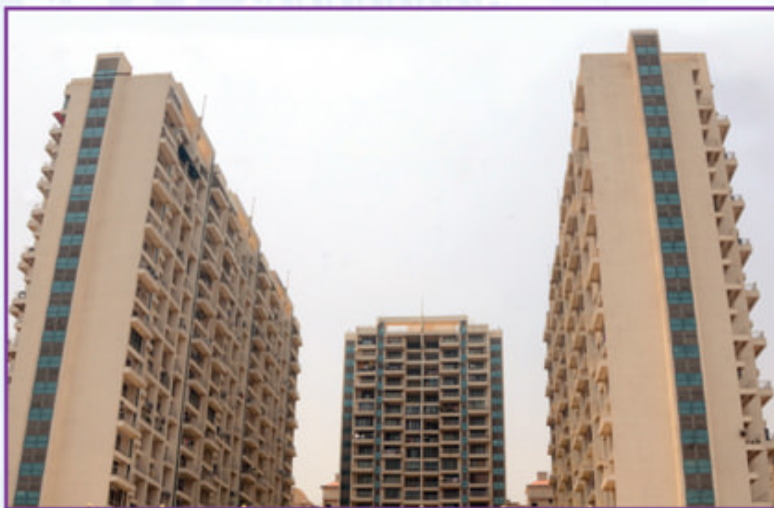
MAHAVIR HERITAGE - KHARGHAR